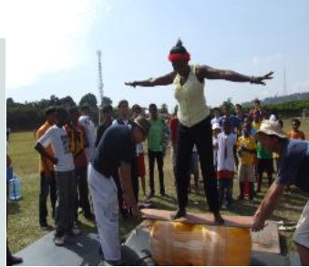
International Day Celebrations